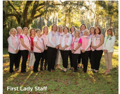
First Lady Staff