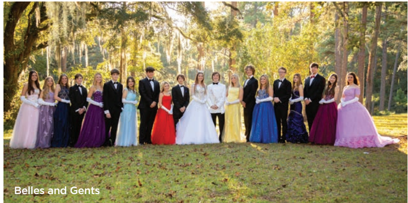
Belles and Gents